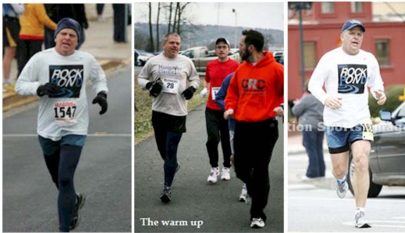
The warm up

Jan 01 - 28th Annual Hangover Classic 10k and Ocean Plunge - Salisbury, MA 49:11 Grand Prix: Jan 25 - One Hour Track Run - Russellville, AR 7.82 miles - 31+ laps - 7:40 pace - One hour Grand Prix: Feb 14 - Valentine's Day 5K - Russellville, AR 21:48 - 6:58 pace Grand Prix: Feb 21 - RiverTrail 15K - North Little Rock, AR 1:12:42 - 7:43 pace Mar 1 - B&A Trail Half Marathon - Severna Park, MD 1:43:28 - 7:48 pace Grand Prix: MAR 07 - Chase Race 2 Mile - Conway, AR 13:27 - 6:40 pace Mar 15 - Little Rock Half Marathon - Little Rock, AR 1:42:29 - 7:43 pace Grand Prix: MAR 28 - Spring Fling 5K - Cabot, AR 22:02 - 7:03 pace Grand Prix: Apr 04 - Capital City Classic 10K - Little Rock, AR Did not run Grand Prix: Apr 05 - Hogeve Half Marathon - Fayetteville, AR 1:51:54 - 8:28 pace Apr 26 - 9th Annual Oklahoma City Marathon - Oklahoma City, OK